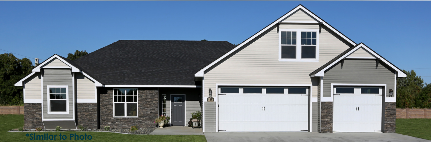
*Similar to Photo