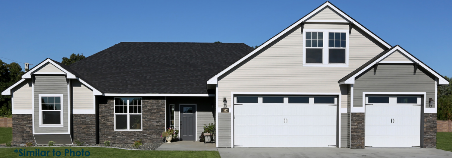
*Similar to Photo