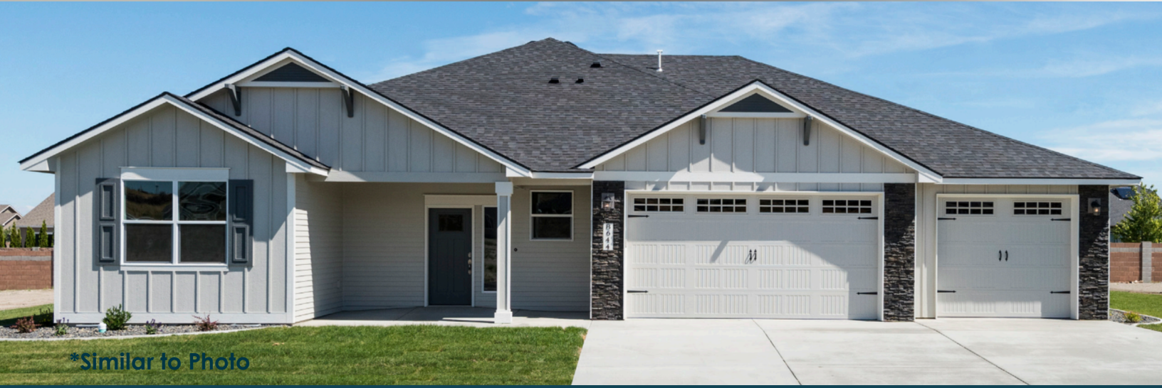
*Similar to Photo