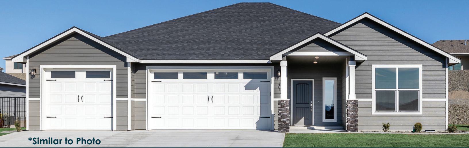
*Similar to Photo