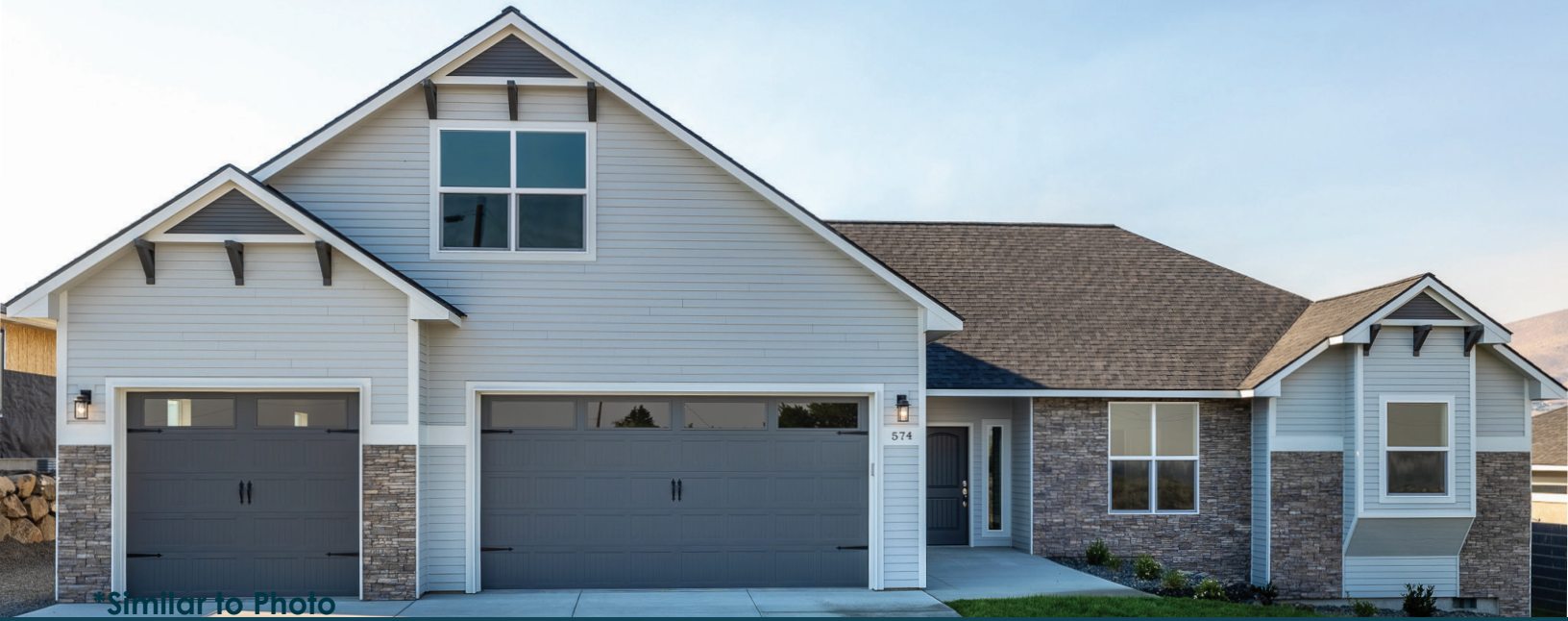
*Similar to Photo