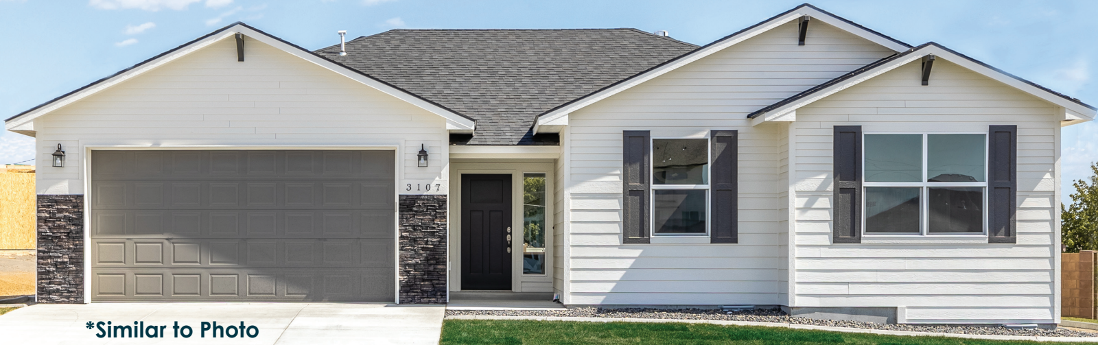
*Similar to Photo