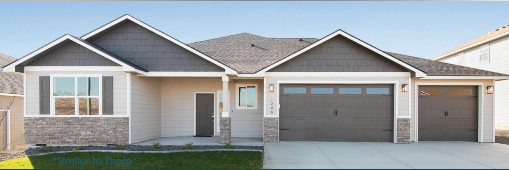
*Similar to Photo